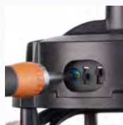
Minor Adjustment box